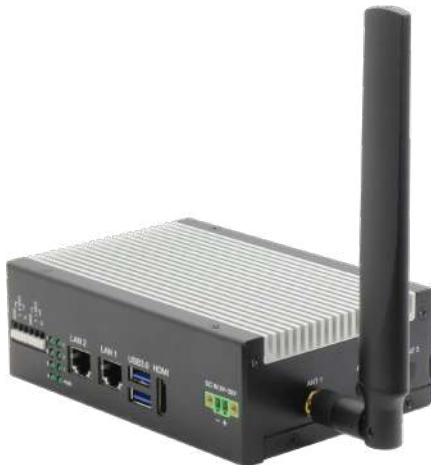
With Antennas installed