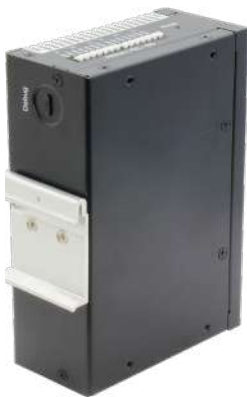
DIN-Rail Mount Illustration